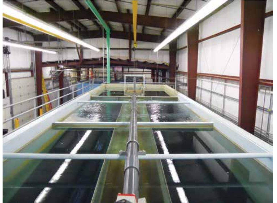
An example of the package plant being tested.

The City is excited about this new water treatment system