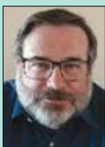
Mayor Jason Freilinger