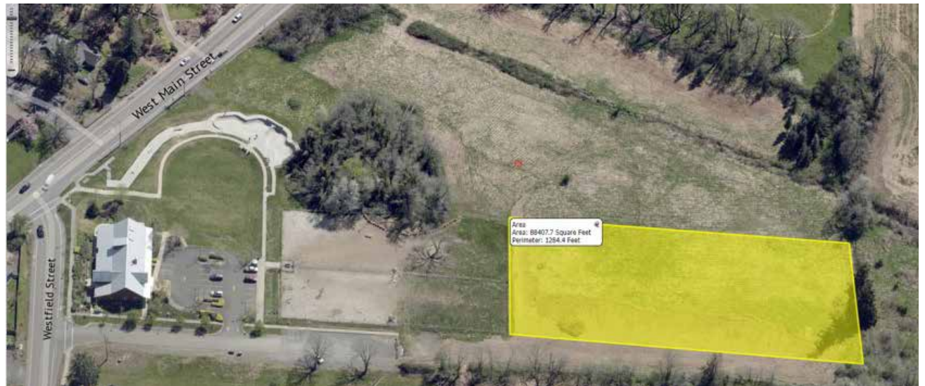
Two-acre site off of Westfield Street designated for an affordable housing project.