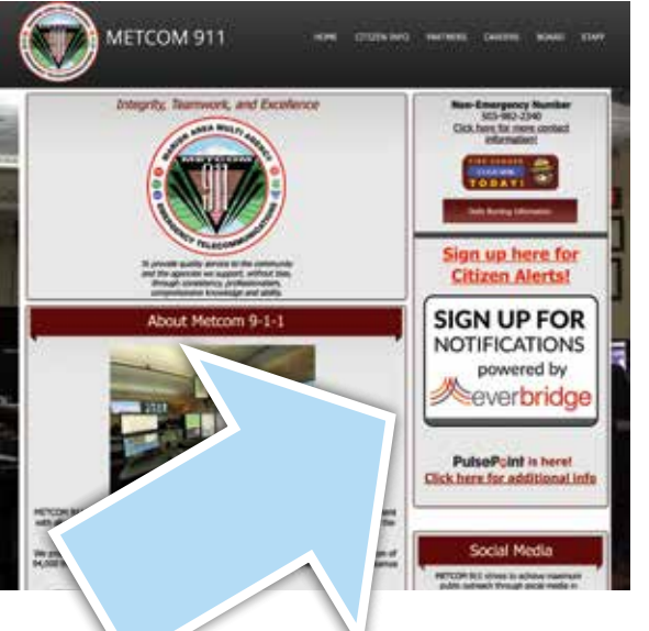
Visit Metcom911.com to sign up!

if they've signed up, too! Also, get your go-bag ready for home, work, and vehicle with tips at ready.gov!