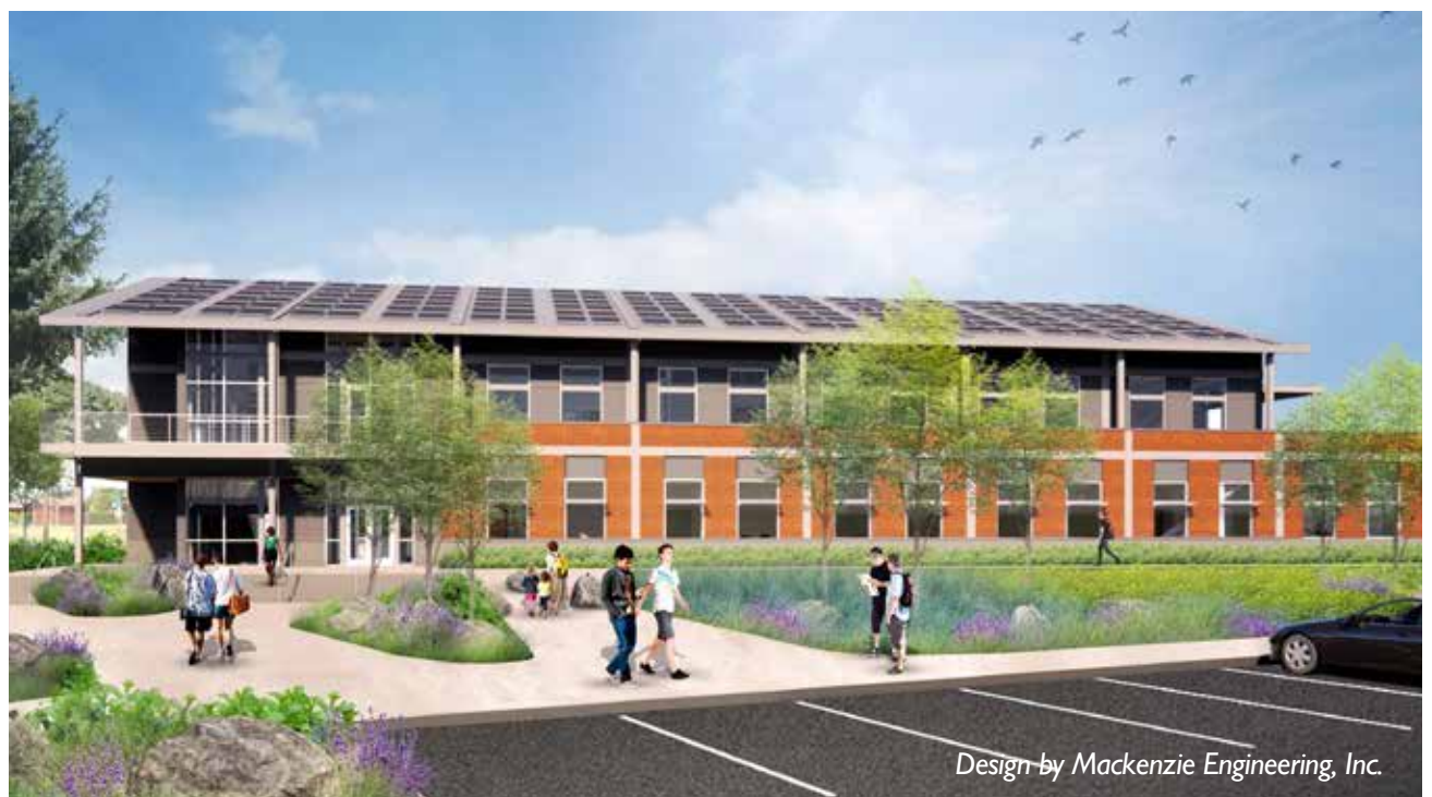
Design by Mackenzie Engineering, Inc.

On Jan. 31, 2019, the City and MIG hosted a Eugene Field Community Workshop to elicit community input on such topics as community values, existing physical conditions, redevelopment issues and the future vision for