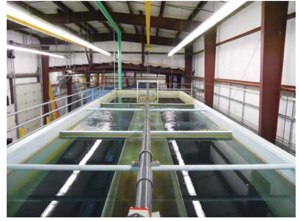
An example of the package plant being tested.

The City is excited about this new water treatment system