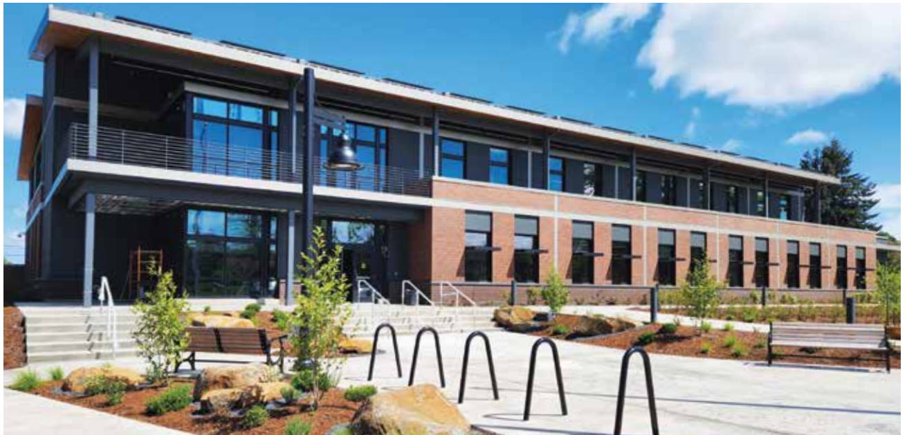
Silverton's new City Hall and Police Department facility on the former Eugene Field campus.