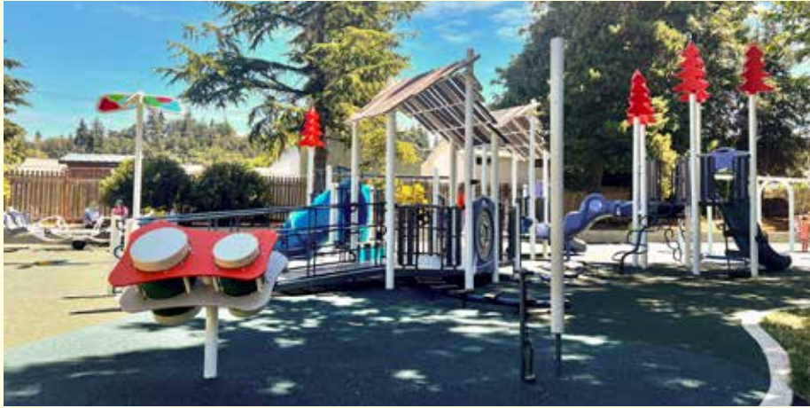
The All-Abilities Playground in Old Mill Park.