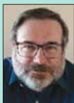
Mayor Jason Freilinger