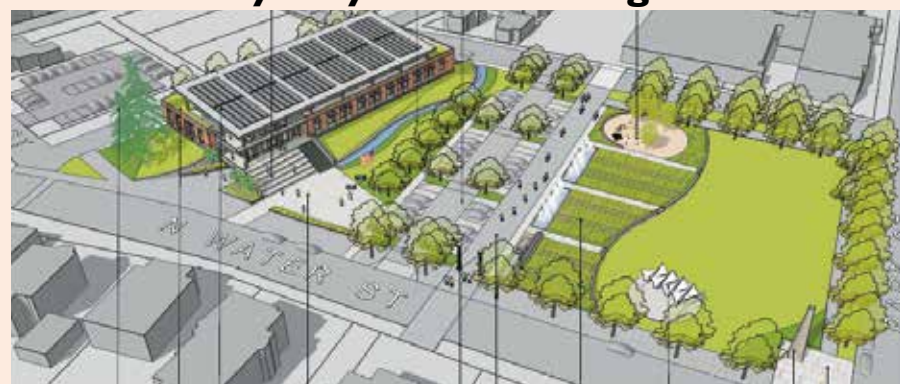
Site Plan for Option 2 as presented in the Design Survey (pre-modifications).

The contract for architectural services with Mackenzie Engineering, Inc. for the design of the Silverton Police Facility/EOC, Municipal Court/Council Chambers and City Hall Facilities (also referred to as the Silverton Civic Center project) was signed on April 22, 2020. Work is in full swing with weekly virtual meetings between Mackenzie and the project team.