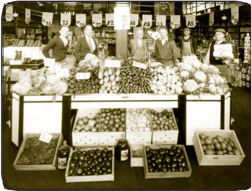
Julius Alm Grocery on N. Water St. offered a wide variety locally-grown organic produce, ca 1925.

Farms are a source of income and food for much of the Silverton community. Changing physical conditions due to climate change may require new crops and/or new cropping regimes and agricultural practices due to weather, pests, weeds, and water availability. Local food production also may change due to changing availability or cost of food transported into the community from elsewhere. A general shift in food consumption toward an increasingly plant-based diet can reduce GHG emissions generated by the meat and dairy sectors, which are significantly more GHG producing than plant-based agriculture. Agriculture may provide a carbon sequestration opportunity and agricultural practices are evolving to include methods that are less fuel and carbon-