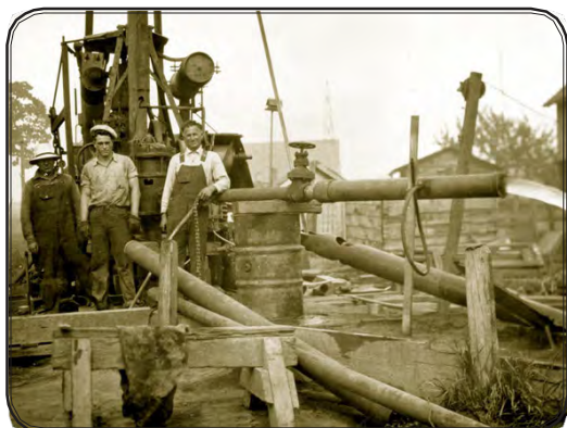
Tapping into the groundwater, as a means of supplementing decreasing supplies, ca 1932.

What is in the Consumption and Waste category?